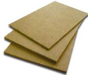
WOOD PLATFORM WITHOUT CARPET