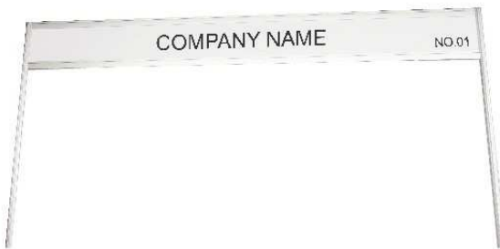
FASCIA BOARD WITH STANDARD LETTERING 10CM. HIGH 100x30 CM