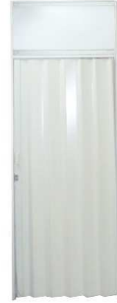
FOLDING DOOR 100x200 CM (SYSTEM BUILT)