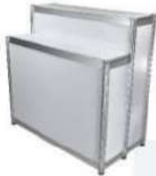
2 - Tier Counter 50X100X100 / 120 cm.