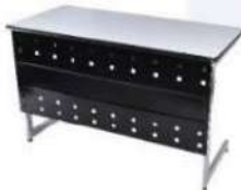
Receptionist Desk 85X120X75 cm.