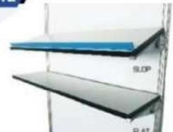
Wall Shelf 25X100 cm.