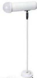
Spotlight 9W. with arm (LED)