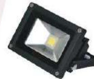
Floodlight LED 30W. 220V. Warm Light (LED)