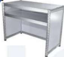
Counter 50X100X75 / 100 cm.