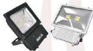
Floodlight 100W. 220V. Day Light (LED)