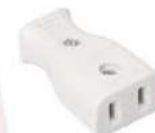
Socket for connecting by exhibitors per unit of 100W.