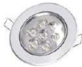
Down Light 7W. (LED)