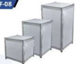
Display Stand 50X50X50 / 75 / 100 cm.