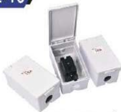
Circuit Breaker Single Phase 220V. 50Hz.