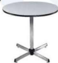
Round Table 75X75X75 cm.