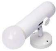
Spotlight 9W. standard (LED)