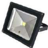
Floodlight LED 50W. 220V. Warm Light (LED)