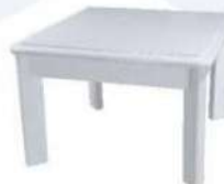
Coffee Table 65X65X40 cm.