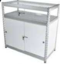
Counter Showcase 50X100X100 cm.