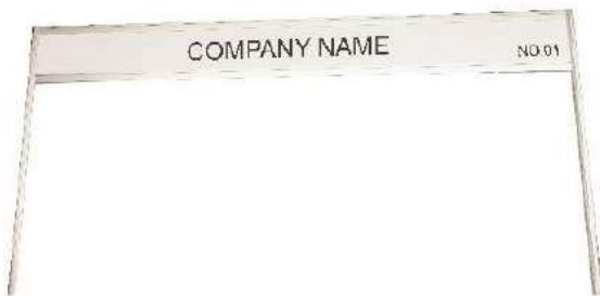
FASCIA BOARD WITH STANDARD LETTERING 10CM. HIGH 100x30 CM