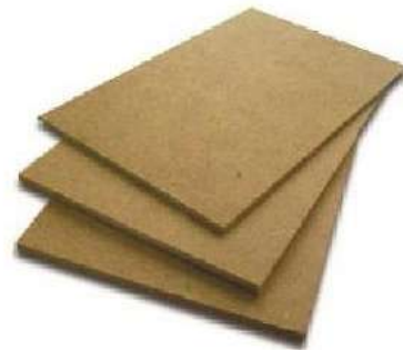
WOOD PLATFORM WITHOUT CARPET