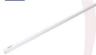
Fluorescent Light 1.2 m. 14W. (LED)