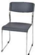
Fiber Chair 50X50X50 / 80 cm.