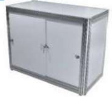
Lockable Cabinet 50X100X75 cm.