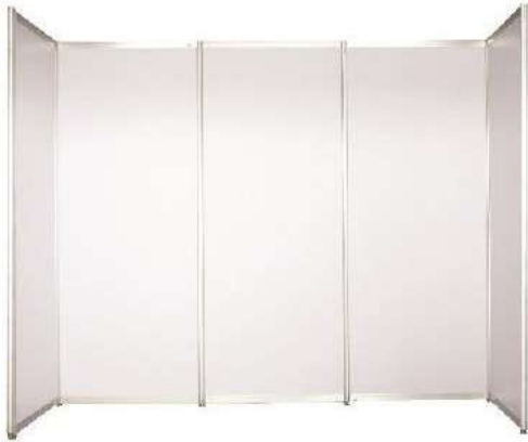
PANEL 100x250 CM (SYSTEM BUILT)