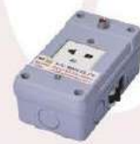
Socket 5 Amp (5 Amp fuse) 220V. 50Hz. (Not For lighting)