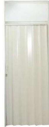
FOLDING DOOR 100x200 CM (SYSTEM BUILT)