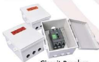
Circuit Breaker Three Phase 380V. 50Hz.