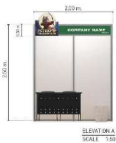
ELEVATION A SCALE 1:50