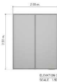
ELEVATION C SCALE 1:50